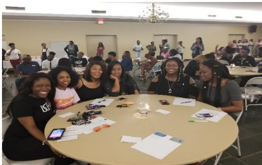
U-Kirk Recognize Campus ministry students

Students has served as presenters and mentors through participation in activities such as music, Bible Study, arts and craft, and face painting during Vacation Bible School. The St. Luke Family recognized and honored perspective graduates and participants with an end of-the year fellowship luncheon in the Fellowship Hall at the church. We still have Summer students who will continue to serve with us, and is excited of what’s ahead. Thanks to the Charleston Atlantic presbytery for affording the u-kirk campus ministry another successful Fall and Spring semester.