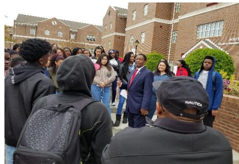
High School students looking forward to the 20018-19